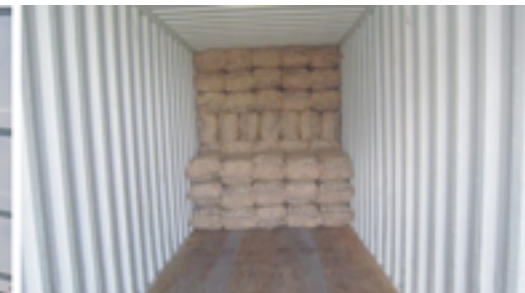
Bags in container