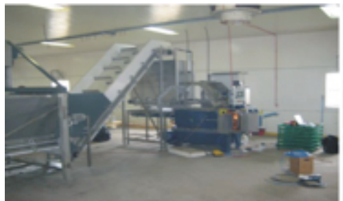
Weighing & packing