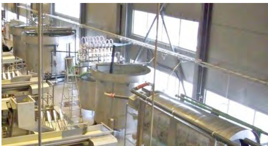
Roe Extraction in action