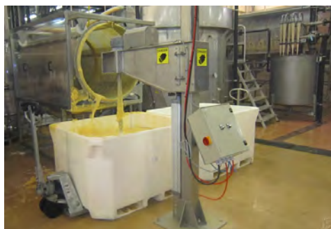
Easy-Sep Filter & Roe Agitator