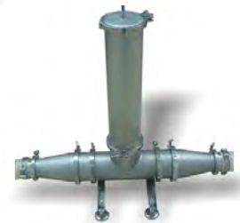
Easy Pipe Pump Sanitary