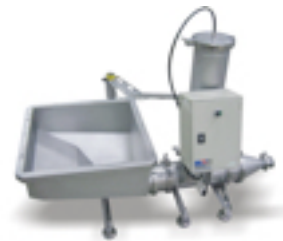
Easy Pipe Pump Sanitary