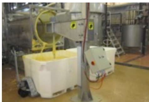
Easy-Sep Filter & Roe Agitator