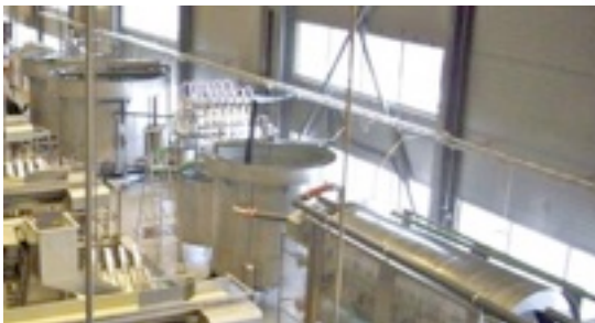
Roe Extraction in action