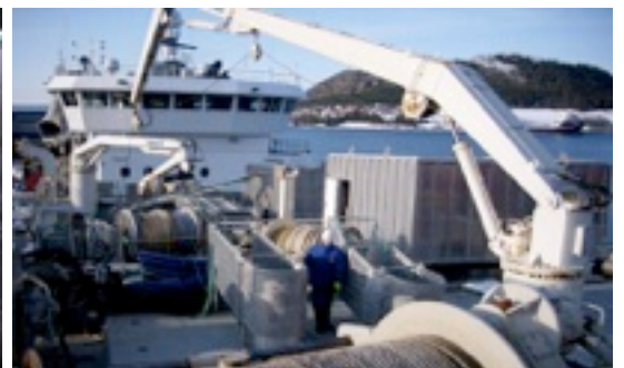
On-board Roe Extraction