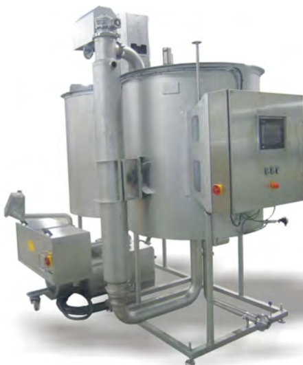
Easy-Inject & Easy Chilling Tower (Cryolator) vertical swept surface heat exchanger, offers the ultimate in the liquid chilling process.