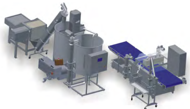
Easy Flaker, Easy-Inject system & TR-850 Injector producing "Fish in Fish" or "Meat in Meat"