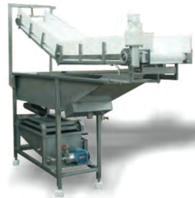
Easy Cooler. To chill fish fillets, meat & other food product that needs liquid chilling, while being processed.