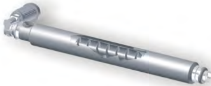
Easy chilling tower