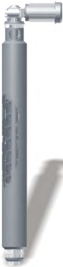
Easy chilling tower

Easy chiller (Cryolator), vertical swept surface heat exchanger, offers the ultimate in the liquid process chilling.