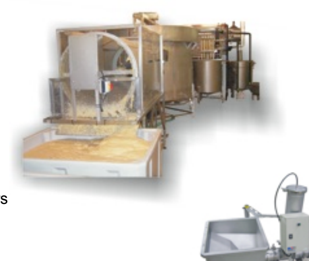
Easy Pipe Pump Sanitary