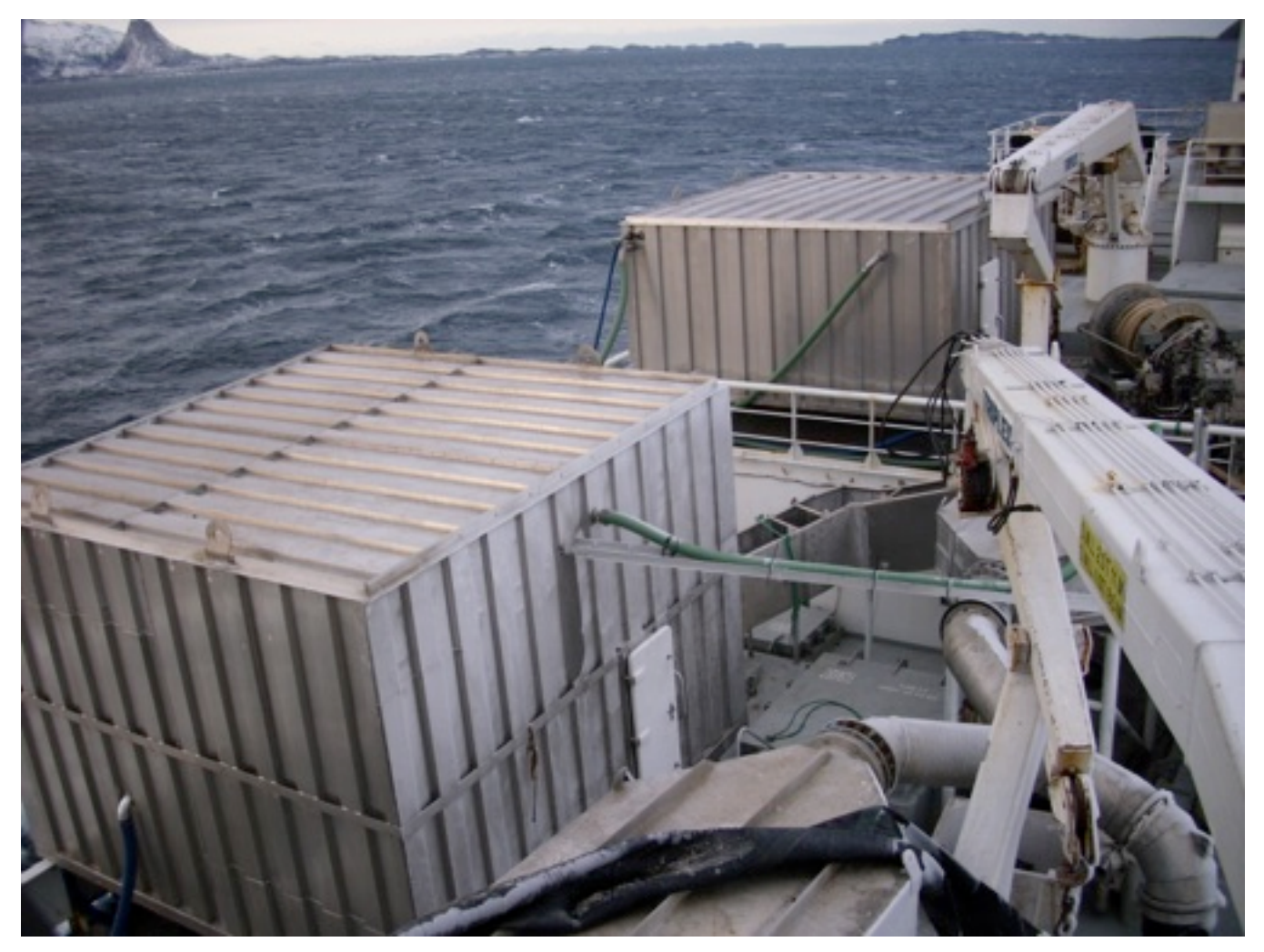
Traust has built number of on-board roe extraction plants for fishing vessels through the years for Herring and Capelin.