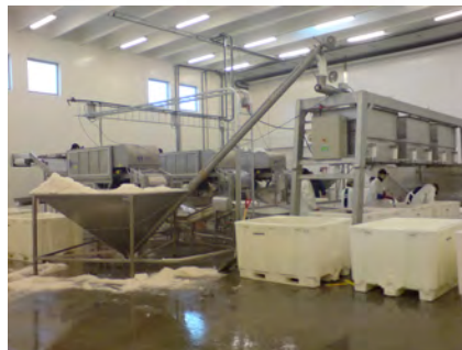
Triple Salt Spreading Line

Dual Salt spreading line and salt buffer.