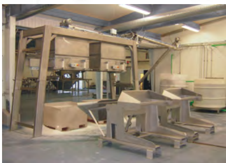
Dual Salt Spreading Line

Dual Salt spreading line and salt buffer.